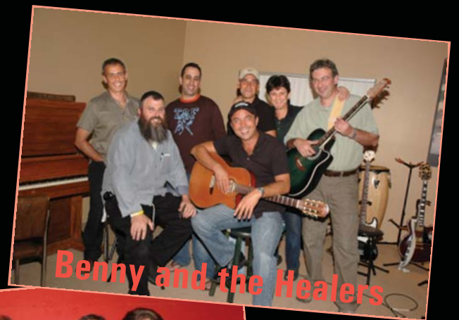
Benny and the Healers