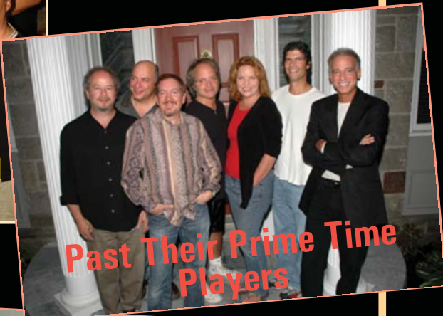
Past Their Prime Time Players