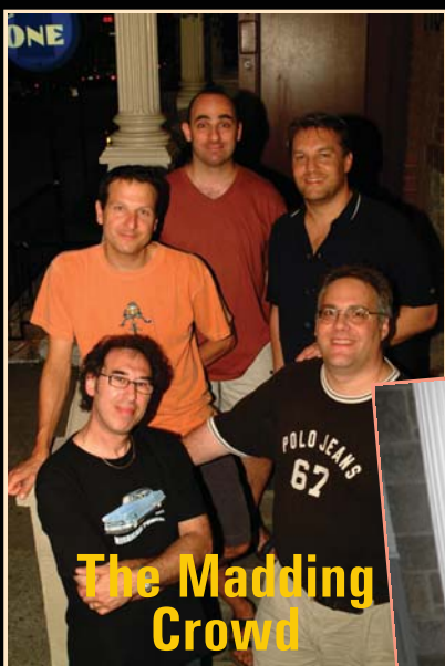
The Maddening Crowd

Wednesday DECEMBER 7, 2005 and Thursday DECEMBER 8, 2005