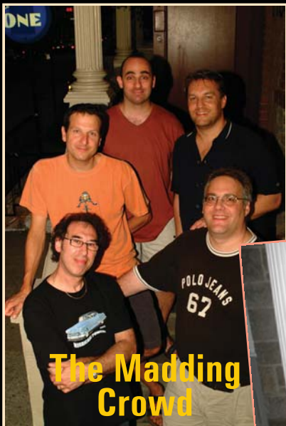
The Madding Crowd

Wednesday DECEMBER 7, 2005 and Thursday DECEMBER 8, 2005